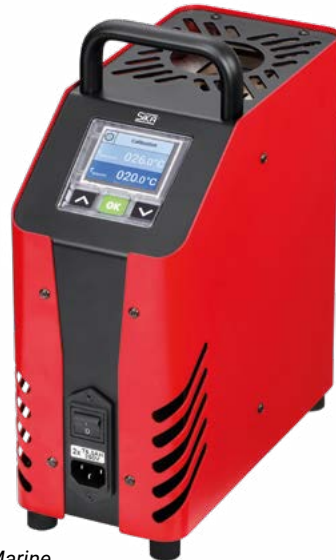
TP Basic Marine

TP Basic // Dry block // RT...650 °C // RT...1202 °F