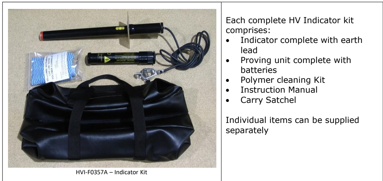
HVI-F0357A – Indicator Kit

A battery powered electronic proving unit is available to allow the fully assembled indicator to be tested at site before and after use.