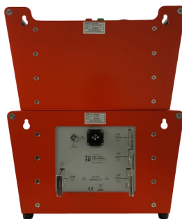
PCU1-SP Mk3 and NLU5000

Where higher currents and powers are required for primary injection, 11kVA and 20kVA primary injection systems are available. The PCU1-SP and PCU2/E systems have separate control and loading units, allowing a wide range of load conditions to be covered with different loading units.