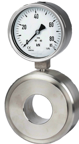
Hydraulic compression force transducer, model F6198