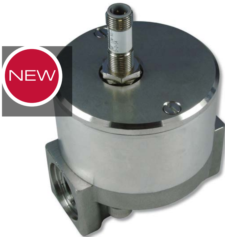
Actual product similar to picture

The HySense® QO 400 is a versatile oval gear flow meter that can be used to measure both volume and flow rate in machine building, plant automation, and process instrumentation applications. Its design and materials make it a perfect fit for use with corrosive fluids, acids, bases, solvents, and dyes. Moreover, its excellent chemical compatibility, combined with resistance to temperatures of up to 125 °C, make it the very definition of a high-end oval gear flow meter.