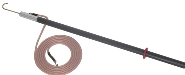
ES30 Earthing stick

If you require a different output voltage test system, please contact us with your specification and we will quote for a custom design.