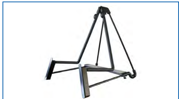
Stand up support