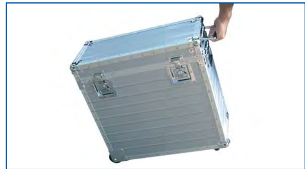
Heavy duty transport case in aluminium