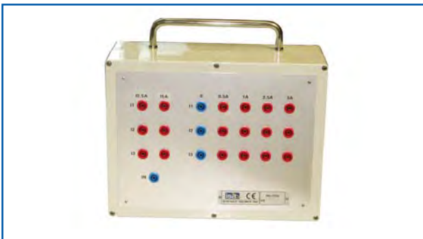
IN 2 CDG - Option for High Burden Relays