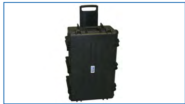
Heavy duty transport case