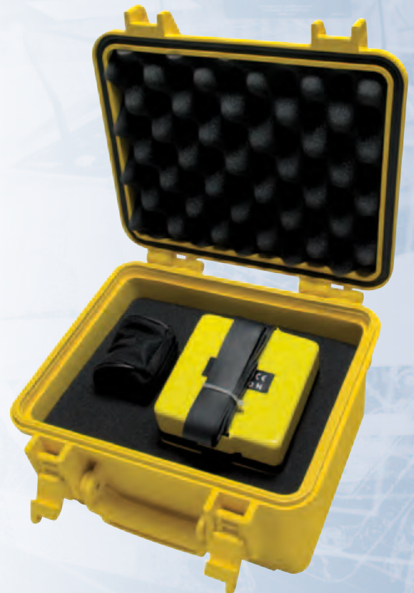
IMEG 500N / IMEG 1000N