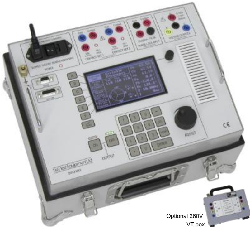
Optional 260V VT box