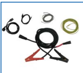
Testing cables and current clamp